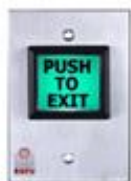
9350 Exit Button